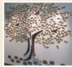
The Founder's Tree

Thanks to a unique partnership between the Grange Insurance Audubon Center and Columbus Audubon (the local chapter of the National Audubon Society), a special Founding Membership is now being offered that entitles you to all of the benefits of both organizations through one all-inclusive membership.